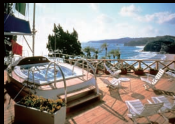
Sailing boat spa "Mermaid"

Ideally located on the seashore overlooking the pristine white sand of Tatado beach, Shimoda Yamatoka affords immediate beach access only a few steps away. All of our rooms offer stunning seaside views of magnificent scenery. Moreover, the Ministry of the Environment has analyzed the water quality of local bathing beaches and rated it AA.