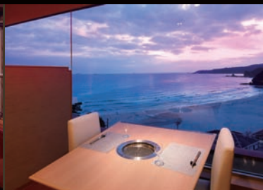
Charcoal dining restaurant "UMI"