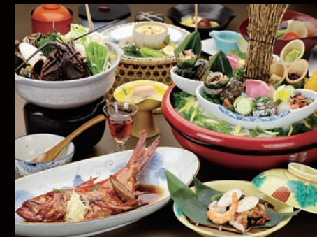
Local seasonal cuisine