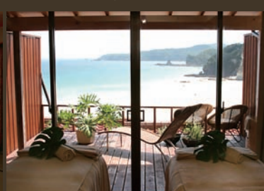
Ocean Spa "Namioto"