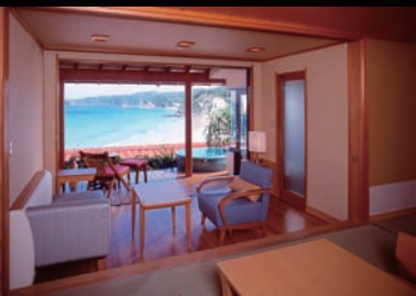
Relax in Japanese-style room and indulge yourself in a private open-air bath.