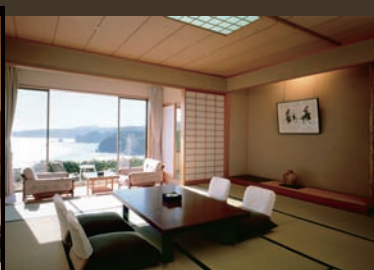
Standard Japanese room