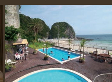
Swimming pool (summer only)